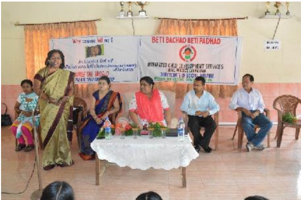
Information on nutritional diets and causes, prevention & cure of anaemia being given by Doctors.