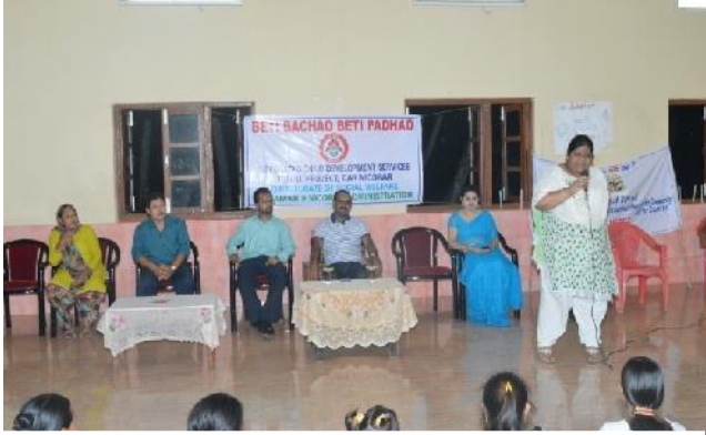
Tips on maintaining healthy habits being given by Dy. Comm. (N).

Demonstrations were given to properly wash hands, to clean teeth and tongue after each meal, to dispose of sanitary tissues etc. Kits containing hand towel, liquid hand wash, toothpaste, tooth brush, sanitary napkin, date and almonds were distributed.