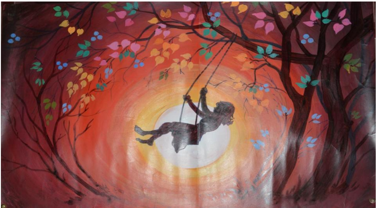
Poster on ‘the flight of the girl’

Additionally, in celebration of these Nicobarese traditions to support their girl children at par or even better than their male counterparts, in order to build a society wherethis half of the population, is given the full sky to spread their wings and fly high and limitless and in order to inculcate the qualities and the will to live a better life by way of improving academic excellence and healthy and nutritional life styles, the district administration has come up with customized banners and posters which have been installed at various community halls, Anganwadi centers and other vantage locations throughout the district. These posters not only appeal aesthetically but also bring out a positive zeal among the girl children of this district. One such poster is displayed as under: