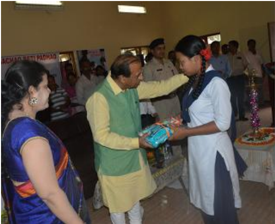
Hon'ble Lt. Governor of A & N Islands distributing Health and Nutrition kits to the daughters of Nicobar District.

Demonstrations were given to properly wash hands, to clean teeth and tongue after each meal, to dispose of sanitary tissues etc. Kits containing hand towel, liquid hand wash, toothpaste, tooth brush, sanitary napkin, date and almonds were distributed.