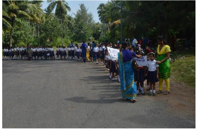
Cycle rallies and Prabhat rallies by school going girls of the District

The good practices being followed in the other parts of the country are also taken into account and accordingly applied in the district. One such practice is the installation of ‘Guddi-Gudda’ boards at District Administration offices as well as at Anganwadi Canters in each of the villages to monitor the cumulative births of children and monthly statistics.