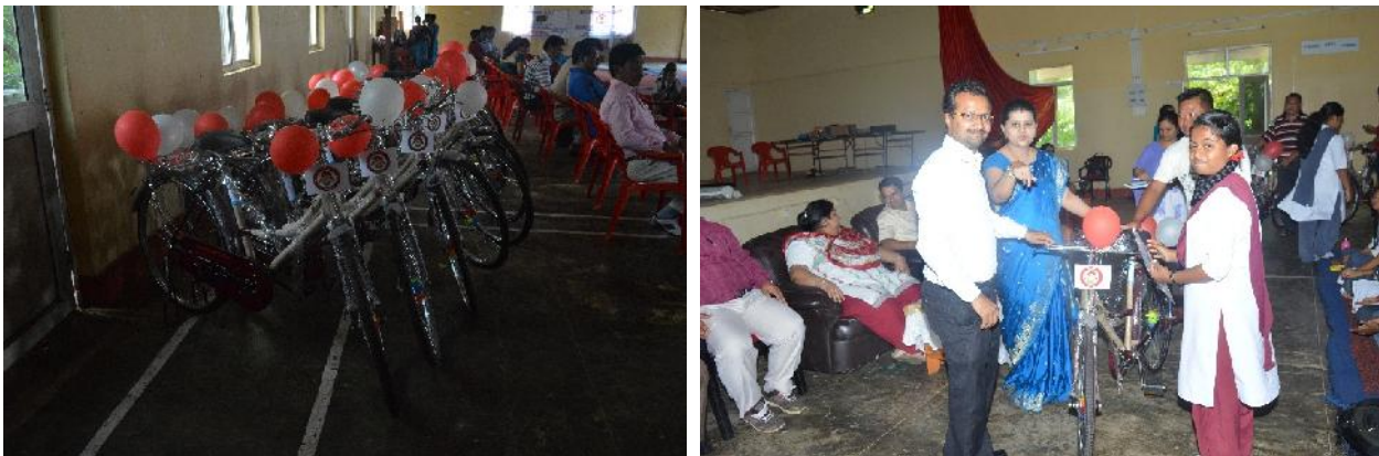
Prizes such as cycles were distributed to the winners

Furthermore, remedial classes have also been arranged for the girl children of the district, the result of which, the pass percentage of girl students have drastically increased which is evident from the table below: