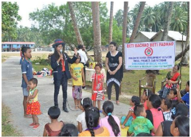
Stage performance by 'Dhoomketu' group of Sang & Drama Division, Ministry of Broadcasting

In addition to the above, a series of events like great women themed fancy dress competition, baby girl shows, distribution of sanitary napkins, cultural evenings, showcasing of women oriented movies like “Chak de” etc. took place, which were well appreciated by the people of Nicobar and especially among women of Nicobar. The district was dotted with Cycle rally, candle marches and media rallies which were great festivals witnessed by the islanders.