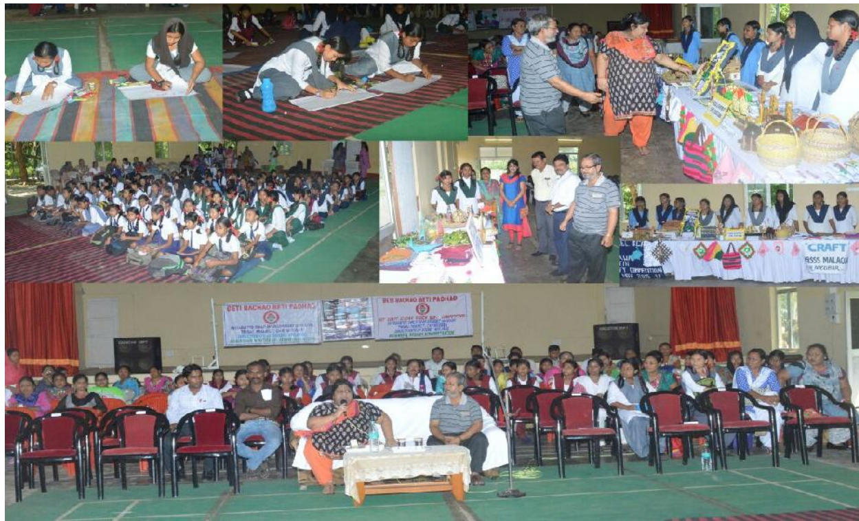
Organization of various academic events like essay, painting and debate competitions.

Attractive prizes including bicycles were given to them which were appreciated in far flung islands of Chowra as well.