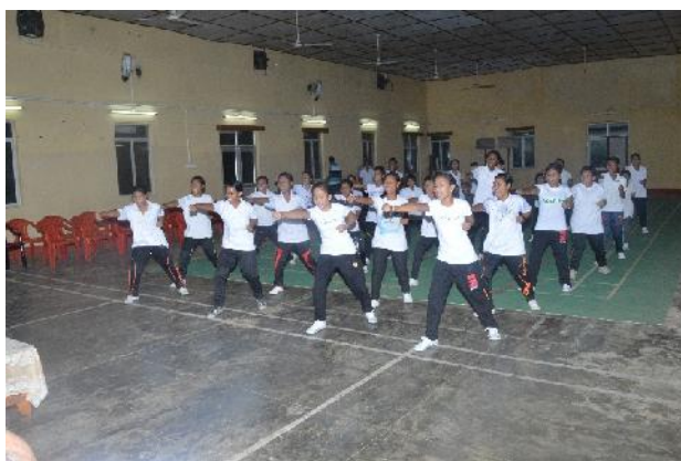
Girls of the district being trained on self-defense in coordination with the Police Department

In the light of the recent demonetization and focus on cashless economy and as part of the BBBP programme, the female teachers of various Govt. schools in the district were also imparted training to further disseminate the information so obtained to the students and especially girl children of classes 11 th and 12 th on usage of Debit/ Credit cards, POS machines and online shopping and banking applications to promote their ability to carry out works which were earlier considered to be men only jobs such as online shopping, banking, purchase of groceries with ATMs/ Debit Cards/ Credit Cards etc.