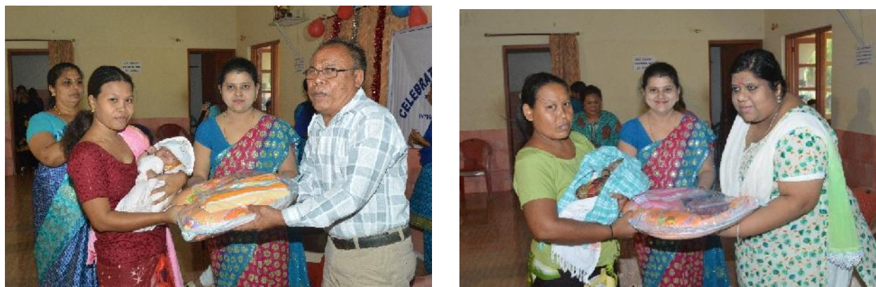
Distribution of health & nutrition kits to mothers and girl children on Beti Janmahotsav

Innovations like placement of ‘Akshay Patra’ at Anganwadi Centers all over the District ensures community participation towards children especially girls by provision of fresh fruits and vegetables right at the Anganwadi's doorstep.