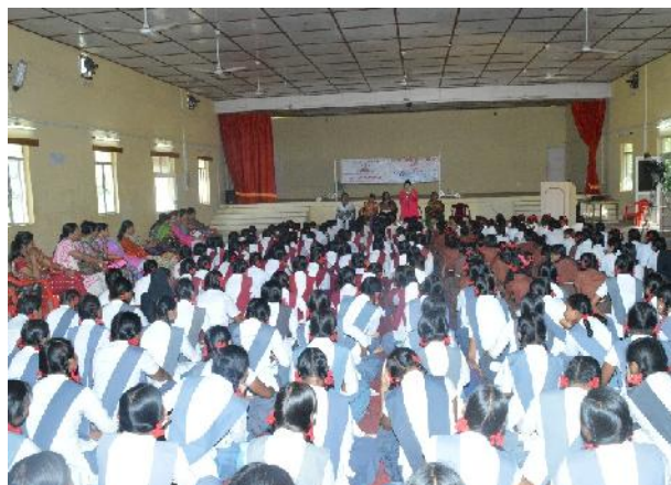
School teachers being provided training on cashless mechanism to further train their respective girl students

The District Administration also developed Information Education and Communication (IEC) materials such as Posters, banners etc. which have been installed at various vantage locations all over the district. These posters were developed in confluence of the various line departments such as the Education Department, the Department of Arts and Culture etc.