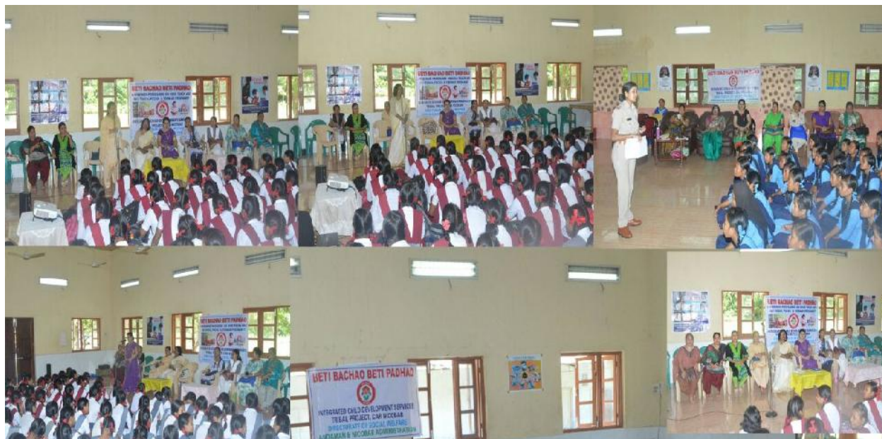
Awareness programme on Good touch, Bad touch, POCSO etc.

One matter of great concern in the district was and still remains, is the prevalence of teenage pregnancy which requires both tact and strategy. This year our target is to develop a full-fledged strategy to combat this problem that kills the adolescence of girls and pushes them in to an early womanhood.