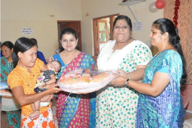
The Dy. Comm. (N) and the BDO Car Nicobar distributing Health and Nutrition kits to the mothers of Nicobar District.